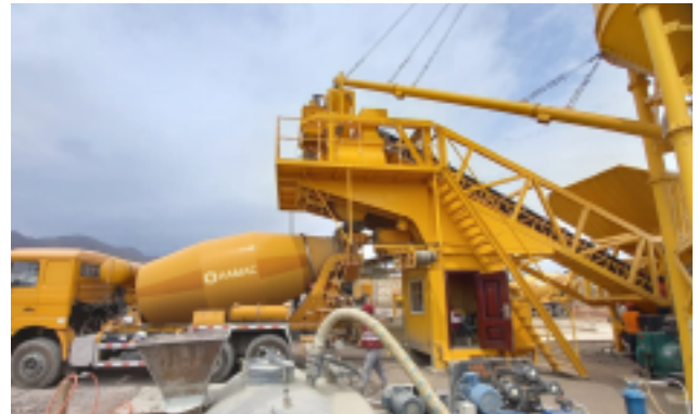
Mobile concrete batching plant is working