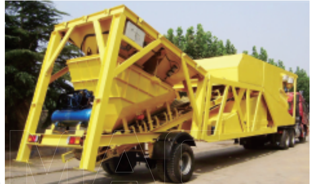
Mobile concrete batching plant is being transported