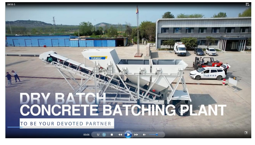
Features of concrete dry batch plant

Dry batch concrete plant is a concrete batching plant without central concrete mixer, this is the most important difference compared with wet batch concrete plant. It is dry mix. All the aggregates, sand, cement and water will be discharged into the concrete transit mixer without mixing. It includes the aggregate weighing system, feeding system, water supply system, bolted type cement silo and weighing system. Its structure is more simple compared with stationary concrete batching plant with a central mixer. Because without the mixing procedure, it will save time for mixing, the concrete can be mixed in the concrete transit mixer truck, so it saves time as well. This kind of dry type concrete batching plant is widely used in many countries such as Philippines, Peru, Chile, Ecuador, Dominican etc.