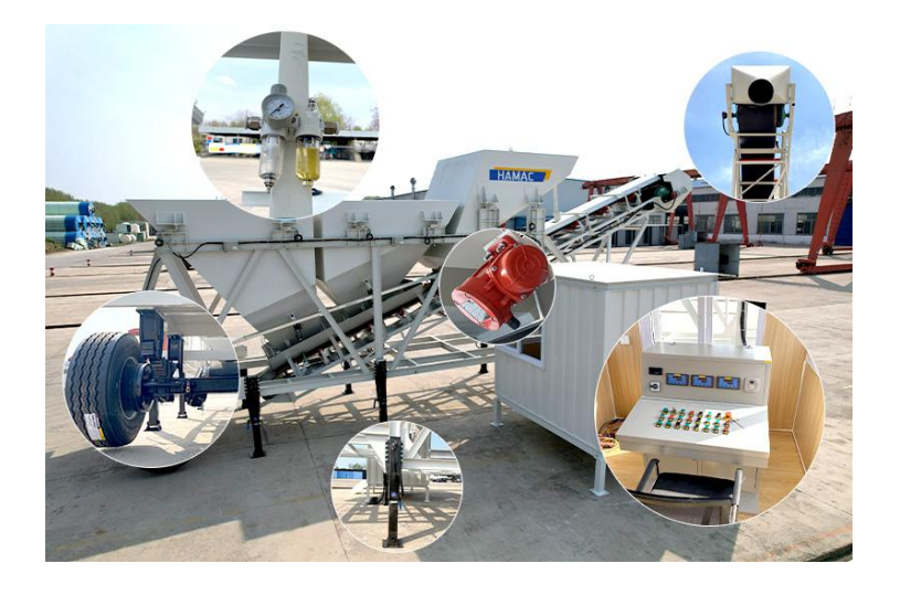
What is the price of dry batch concrete plant?